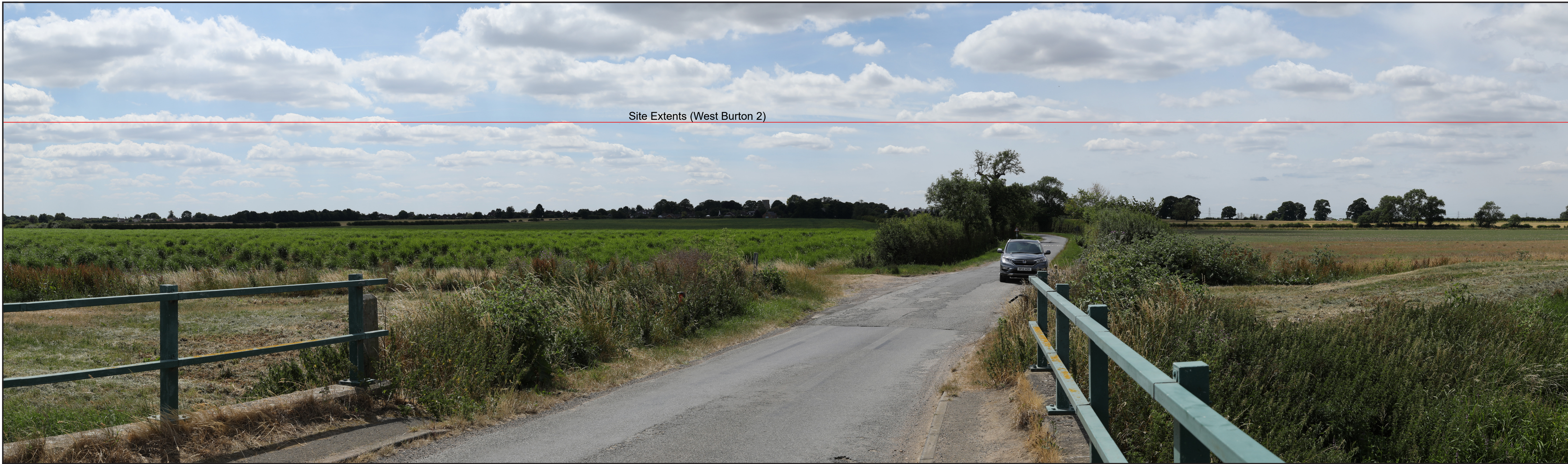
Site Extents (West Burton 2)