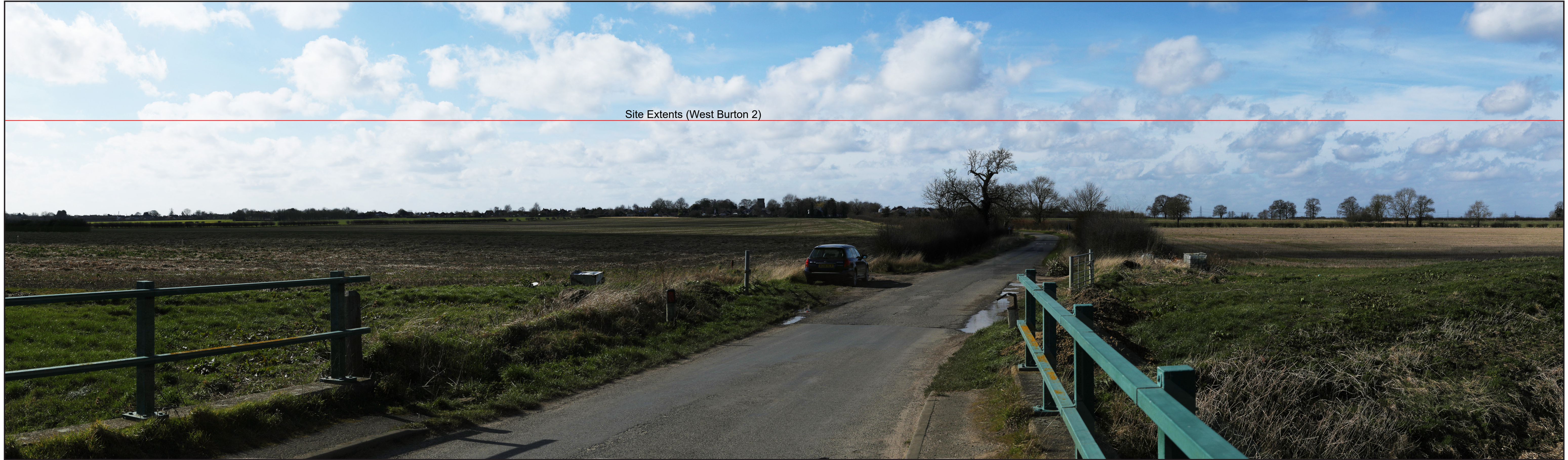
Site Extents (West Burton 2)